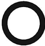
001022-45 Gasket (Qty 10)