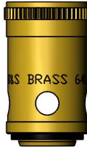
000789-20 Removable Eterna Insert-Left Hand w/ Gasket (Qty 1)