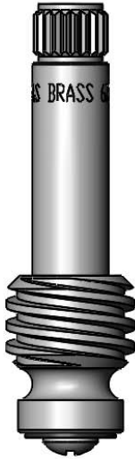
000811-25 Right Hand Spindle (Qty 1)