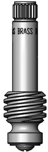
000812-25 Left Hand Spindle (Qty 1)