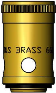
000788-20 Removable Eterna Insert-Right Hand w/ Gasket (Qty 1)

001098-45 (New Style) Eterna Spindle Packing Seal [Replaces 001063-45, 001098-45 (Old Style) & 009745-45] (Qty 6)